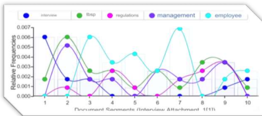
Figure 2. Voyant.com Qualitative Analysis Final interview results

On the other hand, hospitals can assert that they have satisfied human resources management criteria and measures when they have received full accreditation from the Hospital Accreditation Certificate (KARS). Obtaining this certification can serve as evidence of a quality management system that is effective and incorporates staff performance management. Furthermore, investments in the purchase of new medical equipment and the improvement of facilities can demonstrate the hospital's commitment to improving the quality of services. These investments will also have a positive impact on employee performance by providing better equipment and a better working environment. A hospital that makes these investments can demonstrate its commitment to improving the quality of services. According to the difficulties that were encountered in the process of implementing the new system, it may be an indication that employees have difficulty adapting to change, which may lead to the loss of jobs.