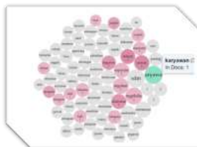
Figure 5. Employee Performance Results (Doctor) Voyant.com

Citra Medika Hospital is also involved in medical education programs, such as being a vehicle for the Clinical Registrar Program and partners of other health education institutions, as well as a vehicle for the Indonesian Doctor Internment Program (PIDI). This engagement demonstrates the hospital's commitment to contribute to the education and training of young doctors, which in turn can enrich the composition of medical employees with trained and experienced doctors. From the point of view of evaluating the number and composition of medical employees, the steps that have been taken by Citra Medika Hospital (Rachmaniyah, W., 2023).