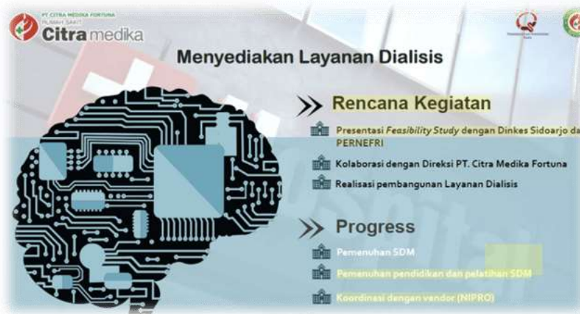
Figure 7. Results of Presentation of Performance Report Document 2023 – 2025