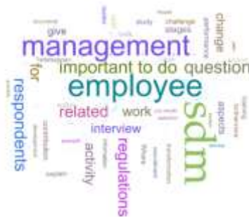
Figure 6. Results of Interview Management on Performance Updates