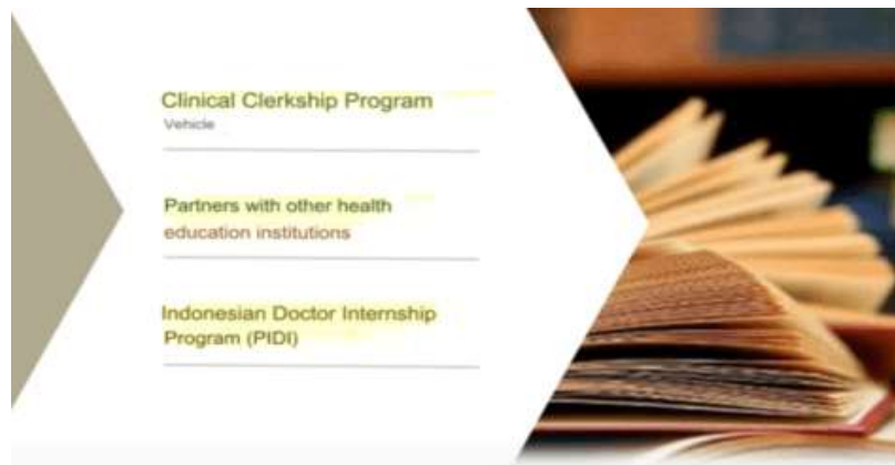
Figure 4. Employee Evaluation Based on the Annual Report of the Strategic Plan 2023 – 2025