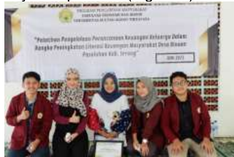
Figure 1. Event Preparation

Pasuluhan Village, the Head of the RT and the Chief Executive. Next is the presentation of the material by the speakers (Figure 3).