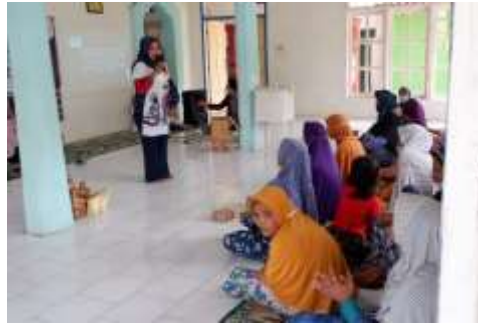
Figure 3. The Presentation

Based on observations during the training activities, several important things were obtained, including the enthusiasm of the participants in listening to material related to financial planning management, then the enthusiasm of the participants in conveying several problems in the management of family financial planning where this can be discussed by resource persons to jointly discuss the solution. and make learning for other participants. Some of the financial problems faced by participants include financial management where expenses are always greater than income, income that always runs out especially to pay debts, no savings even though they have worked for years, new debts to cover old debts and fulfillment of sudden needs.