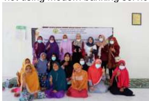
Figure 5. The Participants

Along with the development of technology, people in general move from conventional savings to savings whose storage is more modern. The flow of financial transactions will also be easier when people use i-banking or m-banking facilities. However, most participants never access these facilities. The lack of financial facilities in the village is one of the obstacles. Andreou and Anyfantaki (2020) found a positive relationship between the level of financial knowledge and the level of use of i-banking. More importantly, people with lower education were found to report financial problems related to lack of modern financial facilities and lack of confidence in financial skills being their main reasons for not using modern banking services.