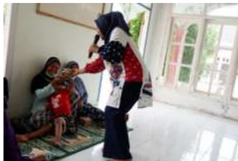
Figure 4. Questions and Answers Session

Based on observations during the training activities, several important things were obtained, including the enthusiasm of the participants in listening to material related to financial planning management, then the enthusiasm of the participants in conveying several problems in the management of family financial planning where this can be discussed by resource persons to jointly discuss the solution. and make learning for other participants. Some of the financial problems faced by participants include financial management where expenses are always greater than income, income that always runs out especially to pay debts, no savings even though they have worked for years, new debts to cover old debts and fulfillment of sudden needs.