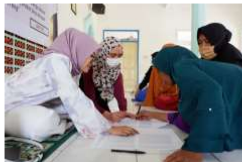
Figure 2. Participant Registration

The presentation of the material went smoothly. Participants seemed enthusiastic in digesting the material presented and asked several questions to the speakers. The training was closed with a quiz session and filling out a questionnaire (Figure 4). The success or failure of the implementation of this community service program requires the participation of participants to resolve their financial problems. Participation of participants in the implementation of this community service program is to provide information about the problems and challenges faced regarding knowledge and financial management, then discuss solutions and problems faced and after participating in this training activity participants can practice the material presented in the training.