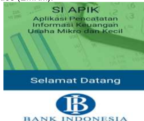
Figure 5. the symbol of the SI-APIK application (financial information recording application for micro and small businesses) of Bank Indonesia

types of businesses, such as service and manufacturing companies, systematically. In addition, this application meets the financial accounting requirements of micro, small, and medium entities (EMKM).