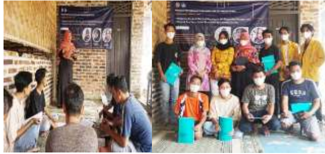
Figure 4. the implementation of community service activities by the team