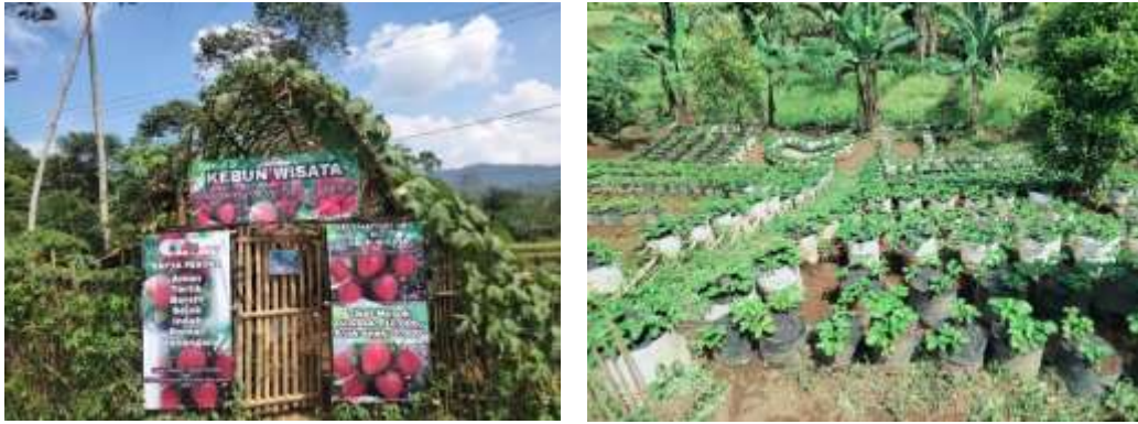
Figure 3. Strawberry Farmfield