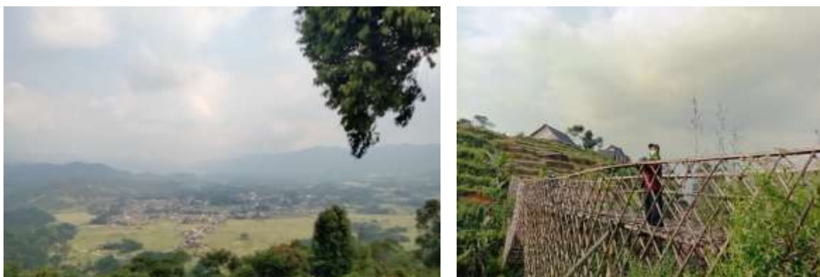
Figure 2. Mount Keneng